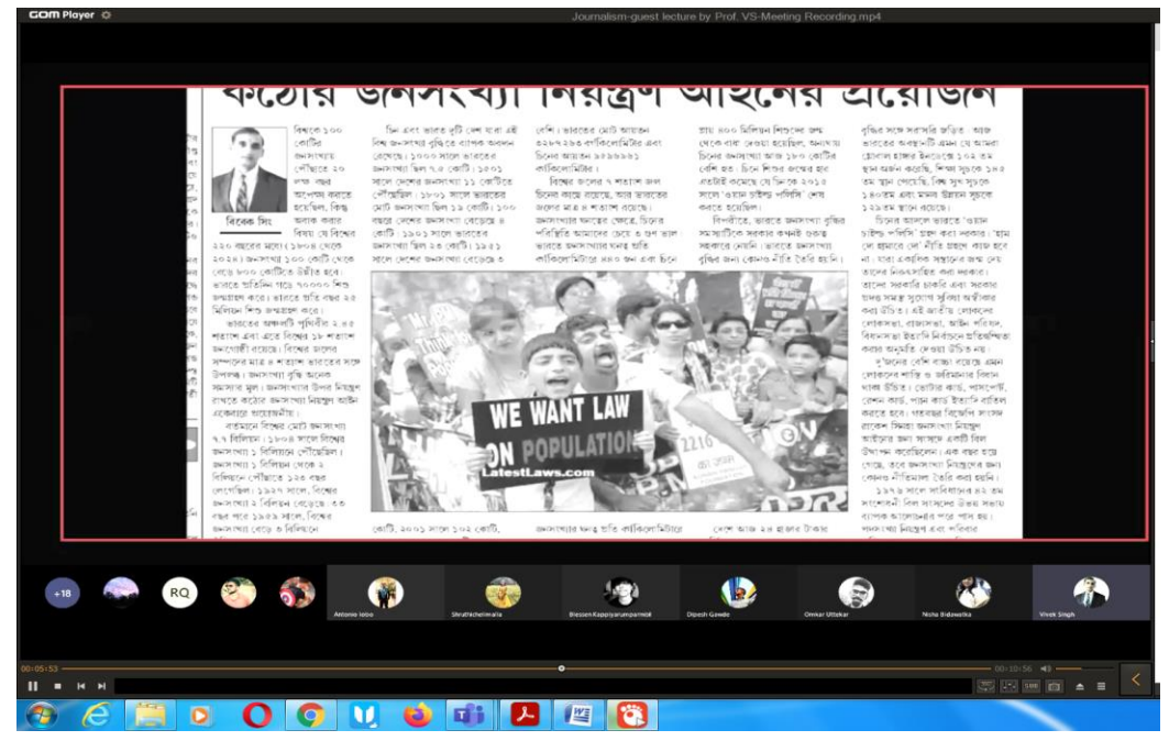
Lecture on' How to Write for Media'